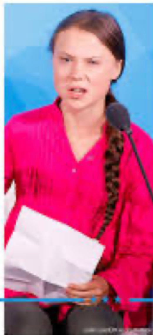
GRETA THUNBERG CLIMATE ACTIVIST

“ We are at the beginning of a mass extinction and all you can talk about is money and fairy tales of eternal economic growth. How dare you!”